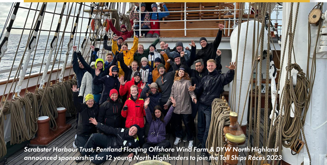
Scrabster Harbour Trust, Pentland Floating Offshore Wind Farm & DYW North Highland announced sponsorship for 12 young North Highlanders to join the Tall Ships Races 2023

DYW North Highland has continued to go from strength to strength, delivering many successful activities and events during the 2022/23 academic year. From mock interviews to awareness campaigns, training opportunities to careers fairs and much more. Our team worked tirelessly in partnership with education providers and employers to inspire confidence, enable relevant employability skills and support access to the workplace for young people in the North Highland region.