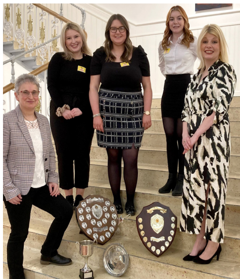
Thurso High School, Young Enterprise “Team Social Eyes” celebrating success with their bumper awards at the Highland regional finals.