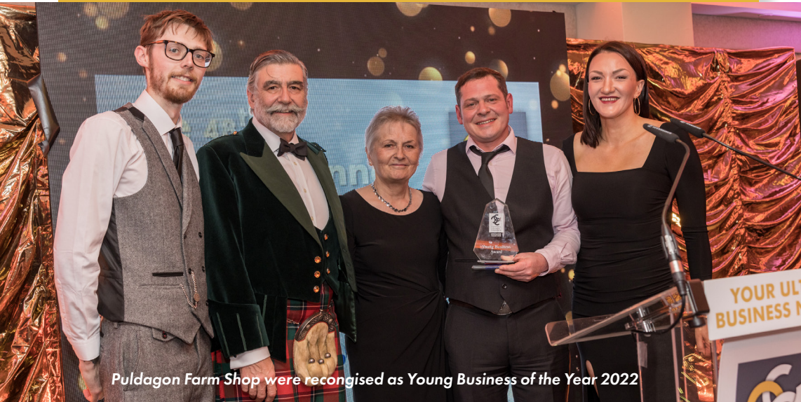
Puldagon Farm Shop were recognised as Young Business of the Year 2022