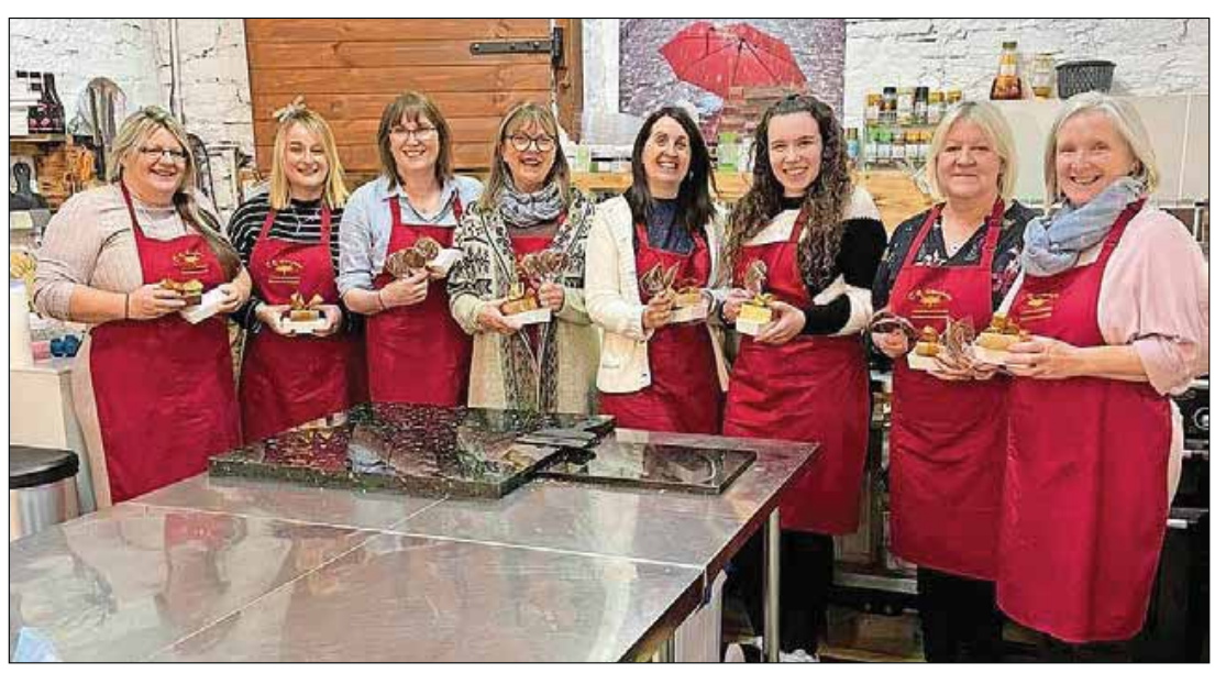
CC Chocolatier offers classes on how to make artisan chocolate.