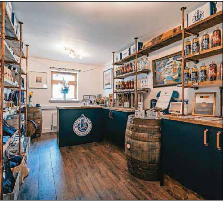
Inside the North Point Distillery gift shop.